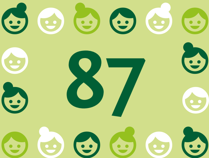
Placements and work experience opportunities generated*