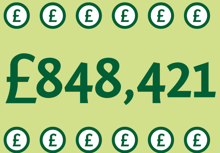
Total monetary worth to the benefit of our local economy*