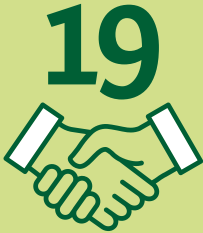
Third-party and private sector partners