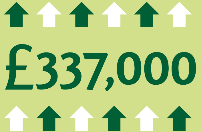
Investment in our volunteering scheme