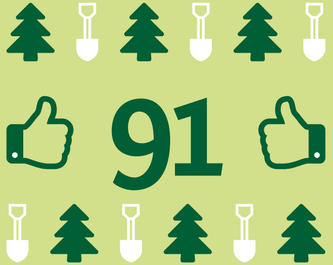
SEND pupils volunteering