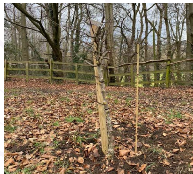
Above: A new community orchard was created using specially selected local and historic varieties of fruit trees.