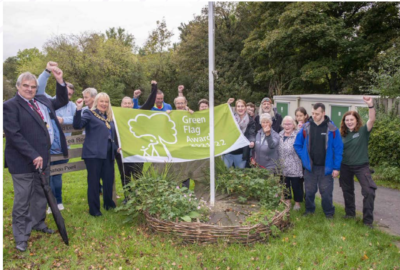
Celebrating our Green Flag Award.

Find out more here: greenflagaward.org/about-us