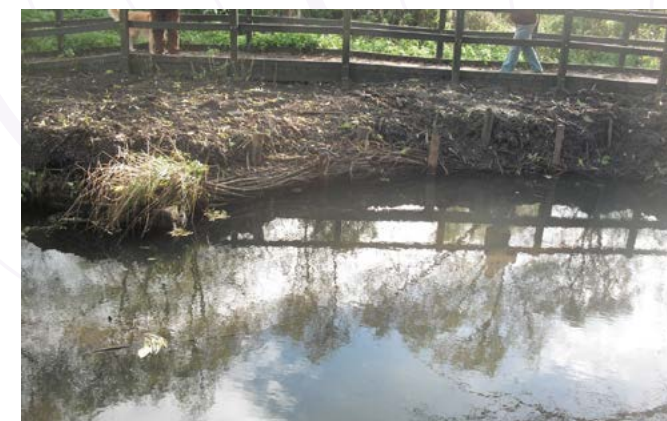
Left: Before the works were completed. Right: After the works were completed. Bottom: Woven bank structure installed.