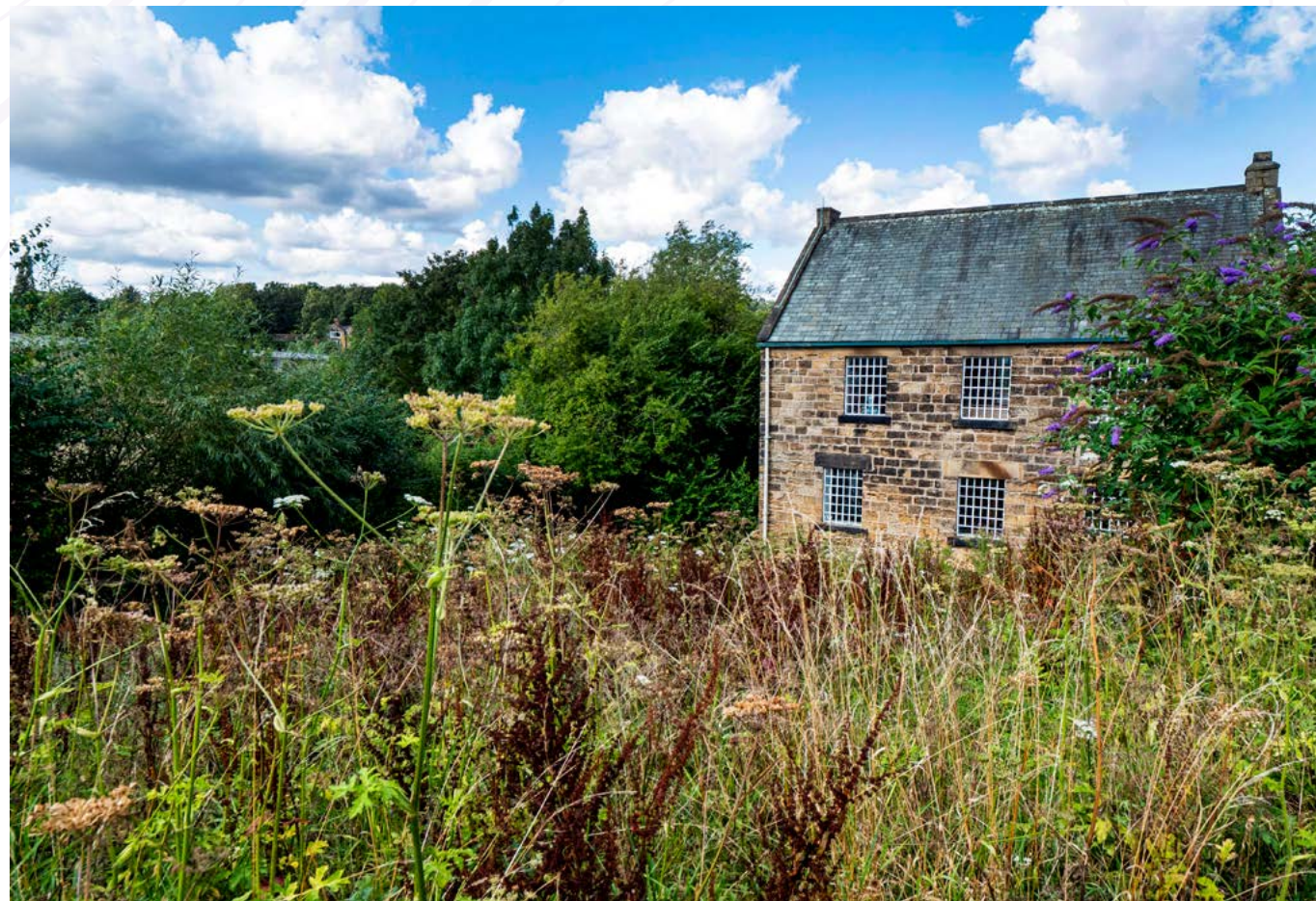
Worsbrough Mill Museum.

This package of works has also seen the development of a new overall signage strategy for the site, into which the creation of interpretation boards and walking routes has been incorporated.