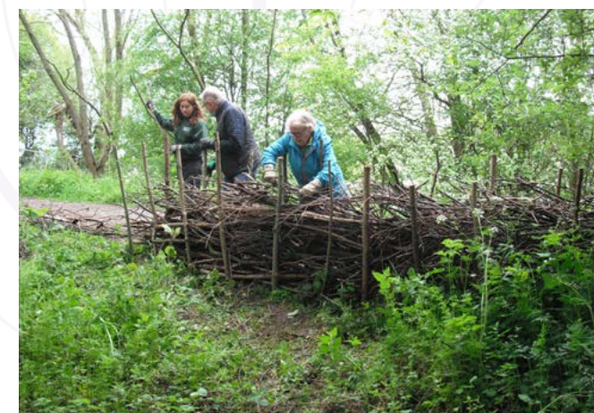
Volunteers dead hedging.