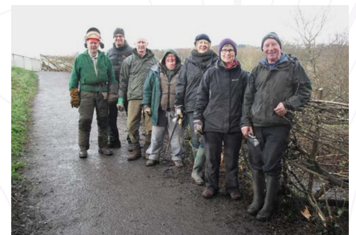
Volunteer hedgelaying day.