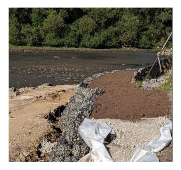
Accessible peg area currently enabling equipment access to Kip's Wall

New 'rock mattress' wall installed, and topsoil laid